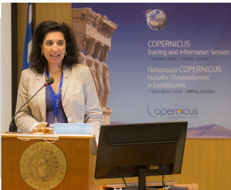
Copernicus InfoSession Athens, Greece 7 October 2016

Thirdly, the European Commission has launched a series of Copernicus Training and Info Sessions across Member States. NEREUS has been tasked to develop a specific module on "Copernicus for Local and Regional Authorities" and has been involved in developing video material to be distributed publicly. The Copernicus Training and Info Sessions are yet another opportunity to reach out to new communities with concrete user-case studies showcasing how Copernicus supports informed decision-making and long-term planning.